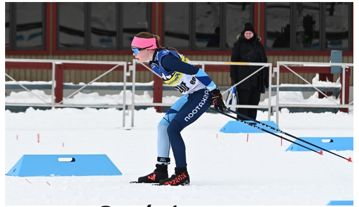
Ready to race